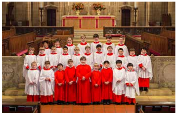
The Treble Choristers of the Saint Thomas Choir of Men & Boys.