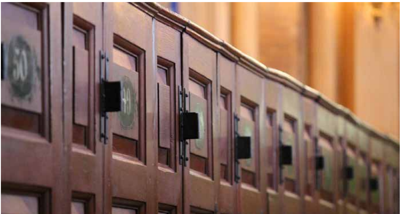
Photo: St. Michael's Church