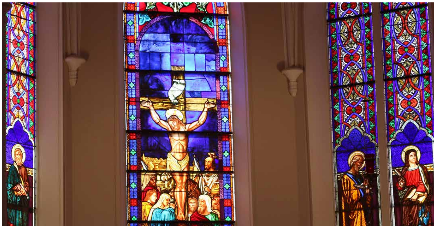
The Voluntary Trumpet, February 2017