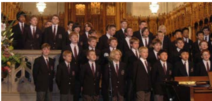
North Carolina Boys Choir